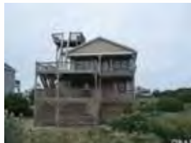
4516 Johnston Lane,

Comments: "golf delight by the sea" a very appropriate name for this beautiful home with wonderful ocean views. Overlooking seascape golf course at the 5th hole. Minutes to the