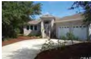
300 Oak Run, Kitty