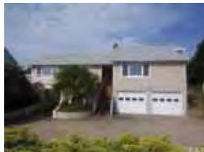
Kitty Hawk $350,000