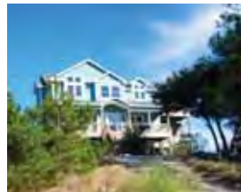
Kitty Hawk $480,000