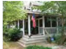
5132 Birch Lane, Kitty

Comments: Great location for year round living, second home or investment property. Beautiful views of the sea scape golf course and some views of the ocean