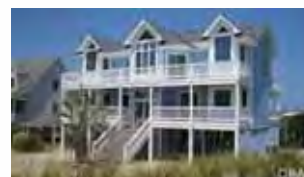
Kitty Hawk $479,900