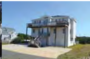
4508 Johnston Lane,

Comments: This home is very misleading from the street. 2662 heated living space, two car garage! The master bedroom is on main living area with no stairs to climb other than