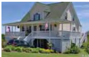
Kitty Hawk $369,000